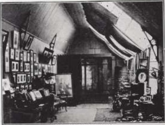
TOM REVELEY'S STUDIO.

A Visit of Inspection is welcomed. You will not be asked for a Sitting.