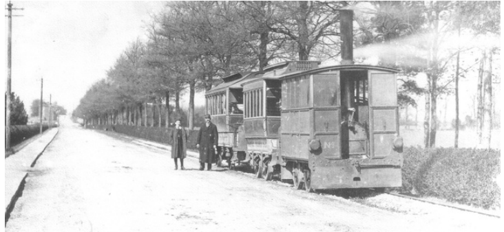
Wantage Tramway: The site of the 'race'.