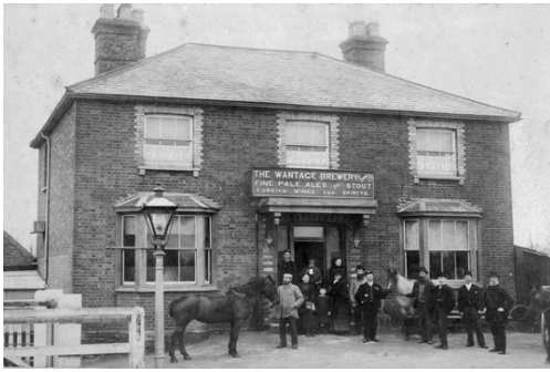
The Volunteer Arms